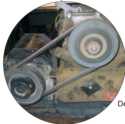
Design for use