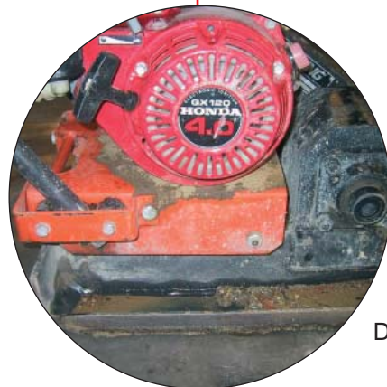
Design for use