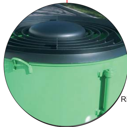
Ring cover with a sack knife