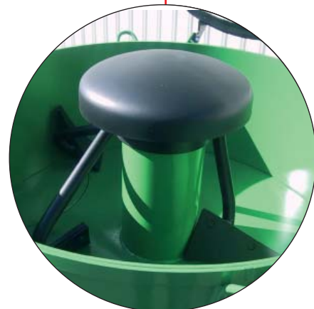
SM 320 head